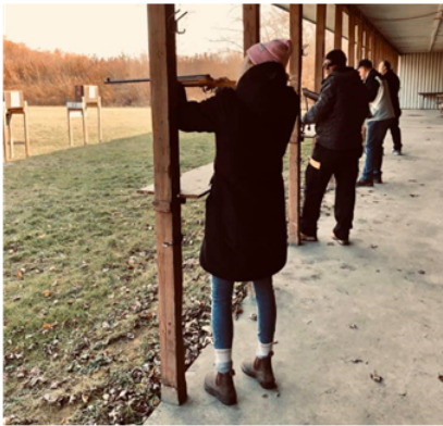
Test your skill at target shooting

Sunday May 5, 2024 Starting at 11:00am in the GERMANIA PARK